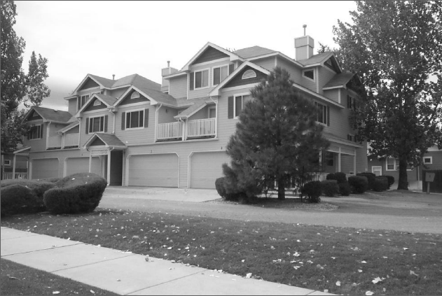
Greeley Transitional House 1206 10 th Street Greeley, CO 80631