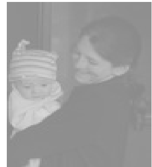
The majority of families we serve are single parent families (primarily women) with very young children and infants.